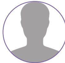
TBA HICCS 2018 Networking Chair